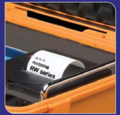
Built in printer